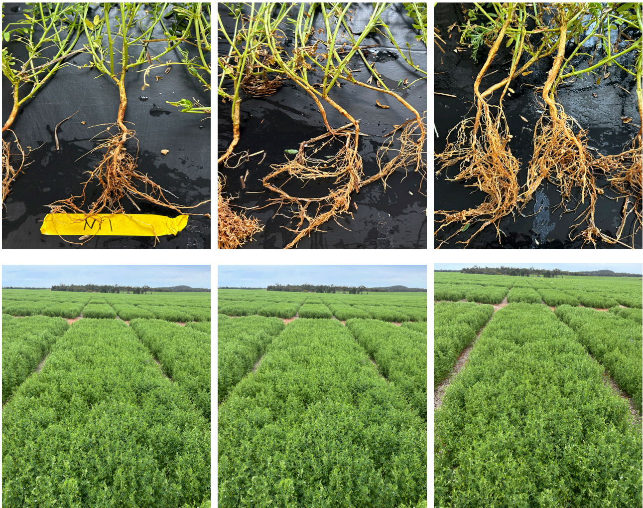
Figure 3: Lentil nodulation of the Nil (left), Grower practice (middle) and manure (right).