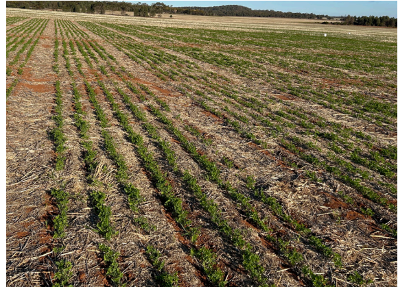
Figure 1: Establishment June 2025.

The average establishment score of the trial was 7.8, with an average plant count of 75 plants/m 2 .